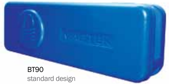
BT90 standard design