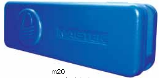
m20 standard design