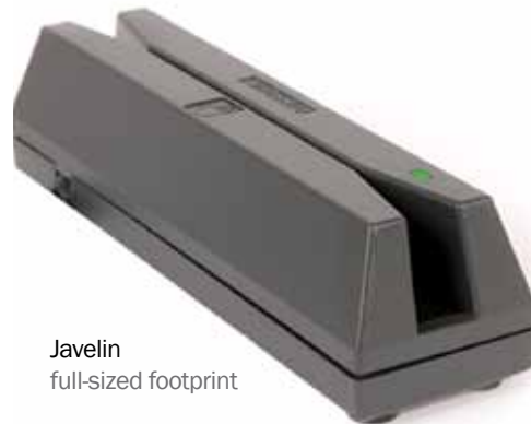
Javelin full-sized footprint