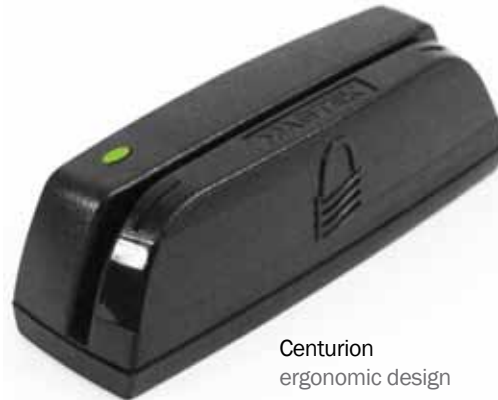
Centurion ergonomic design