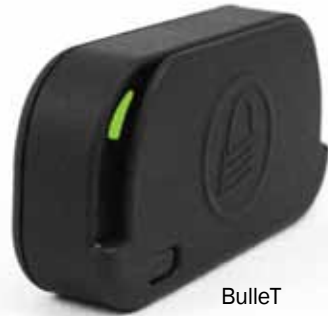
BulleT ergonomic design