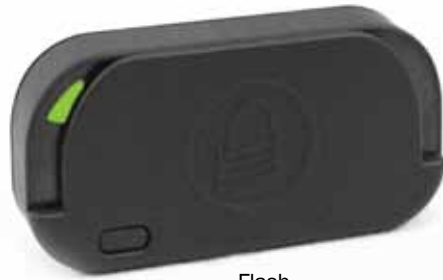
Flash ergonomic design