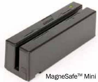
MagneSafe™ Mini standard footprint